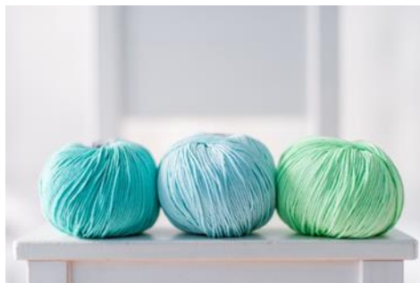
Do you like to knit or crochet?