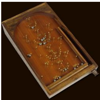
Bagatelle – What is its history?